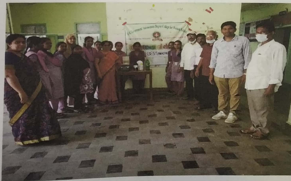
Staff members of Department of Chemistry and students after completing the sanitizer preparation