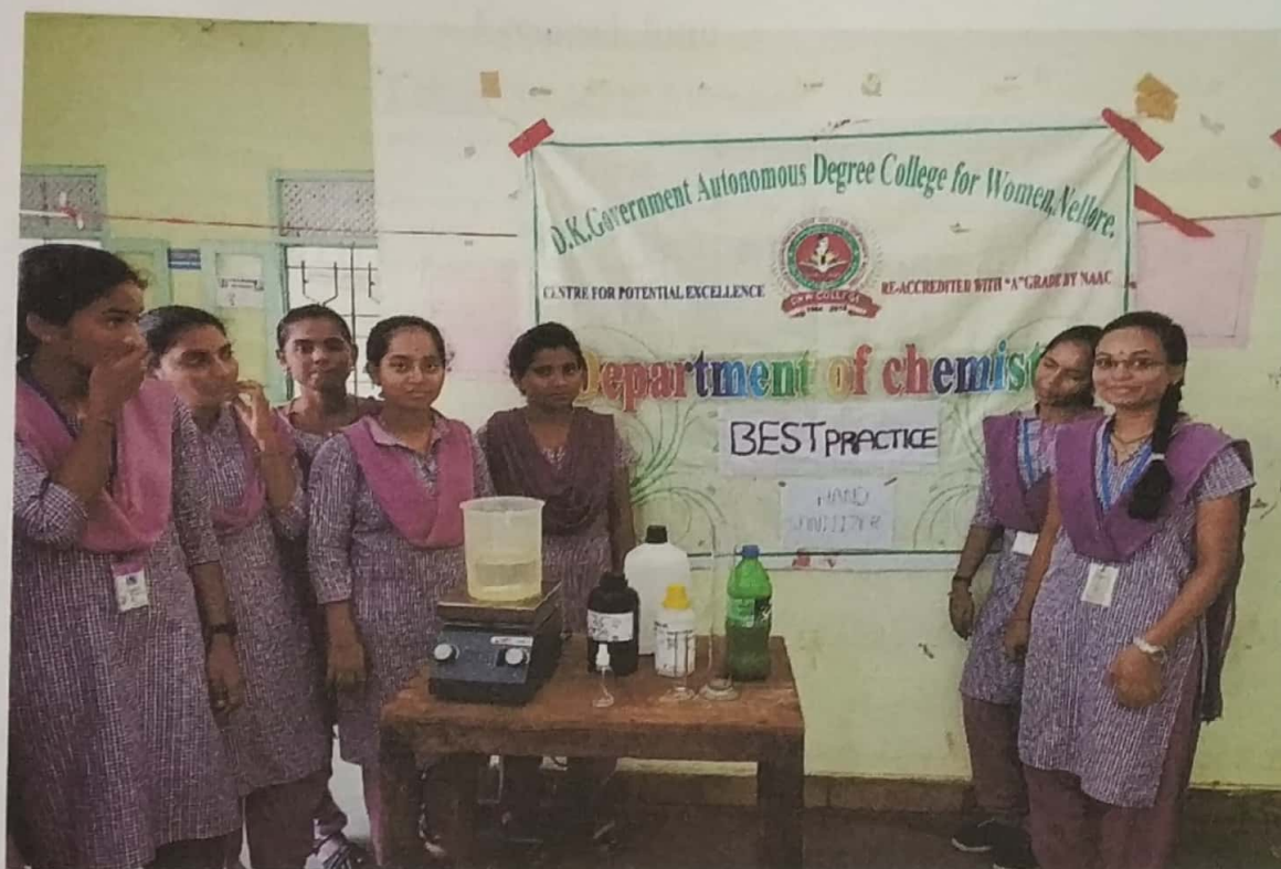
Students while preparing the sanitizer